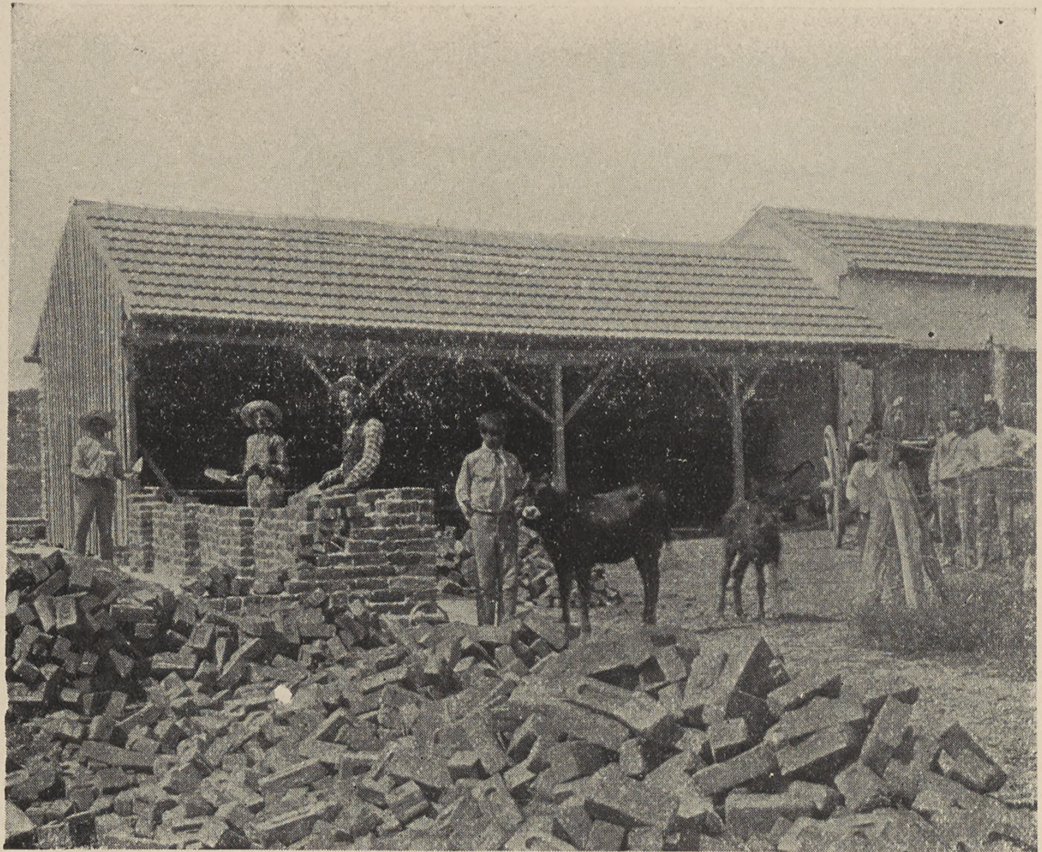
SCHOOL BOYS BUILDING THE BARN