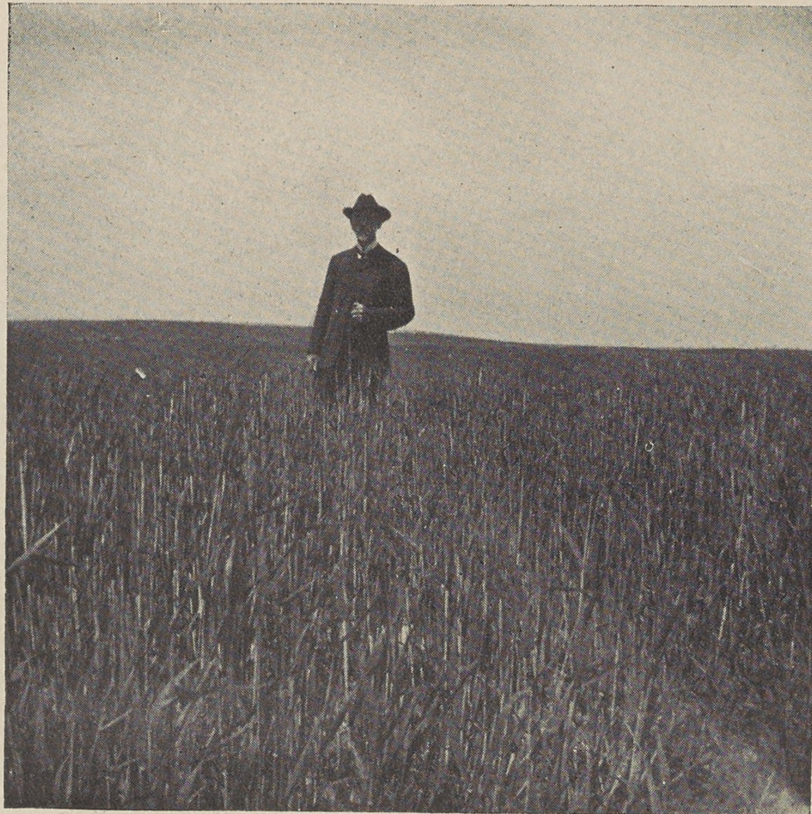
OUR NEIGHBOR'S BARLEY FIELD, ACROSS THE ROAD FROM OURS