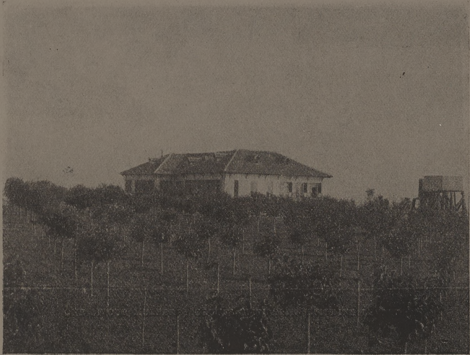
ONE OF OUR MULBERRY GROVES, WITH MAIN BUILDING BEYOND