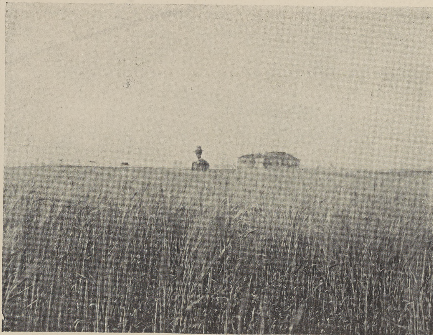
OUR MODEL BARLEY FIELD